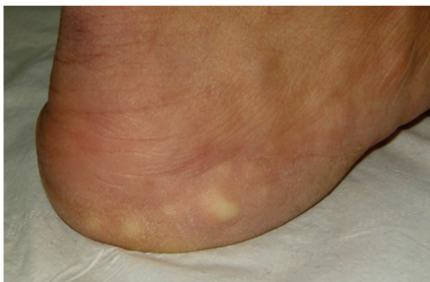
Figure 3. Piezogenic papules of the feet which are subcutaneous fat herniations through the fascia. They often appear as blanching white nodules only while bearing weight.