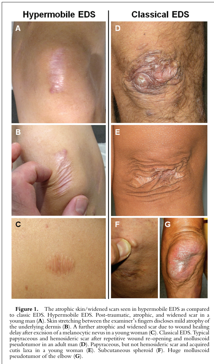
Figure 1. The atrophic skin/widened scars seen in hypermobile EDS as compared to classic EDS. Hypermobile EDS. Post-traumatic, atrophic, and widened scar in a young man (A). Skin stretching between the examiner's fingers discloses mild atrophy of the underlying dermis (B). A further atrophic and widened scar due to wound healing delay after excision of a melanocytic nevus in a young woman (C). Classical EDS. Typical papyraceous and hemosideric scar after repetitive wound re-opening and molluscoid pseudotumor in an adult man (D). Papyraceous, but not hemosideric scar and acquired cutis laxa in a young woman (E). Subcutaneous spheroid (F). Huge molluscoid pseudotumor of the elbow (G).

More than 90% of cEDS patients harbor a heterozygous mutation in one of the genes encoding type V collagen (COL5A1 and COL5A2).